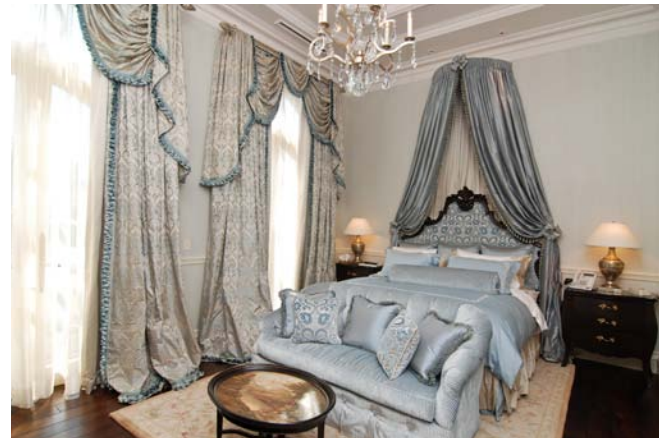
Young Man's Bedroom Suite