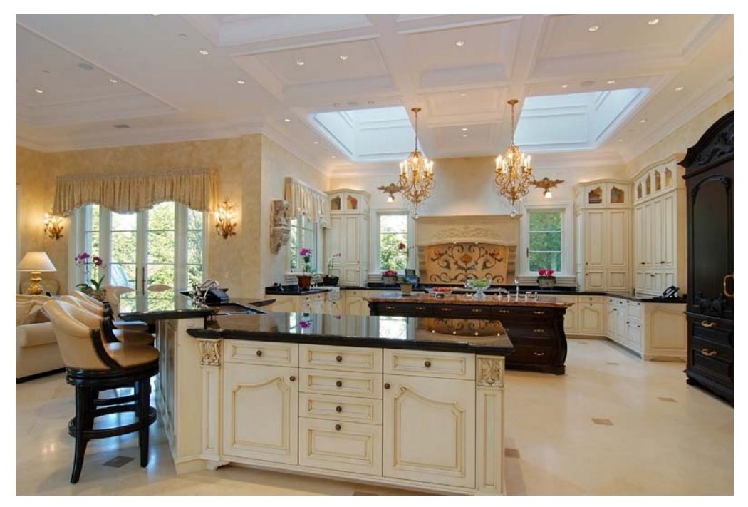
Grand Kitchen (catering kitchen & galley not pictured)