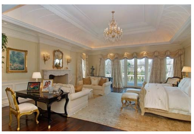
Master Suite with Retreat and Bathing Pavilion