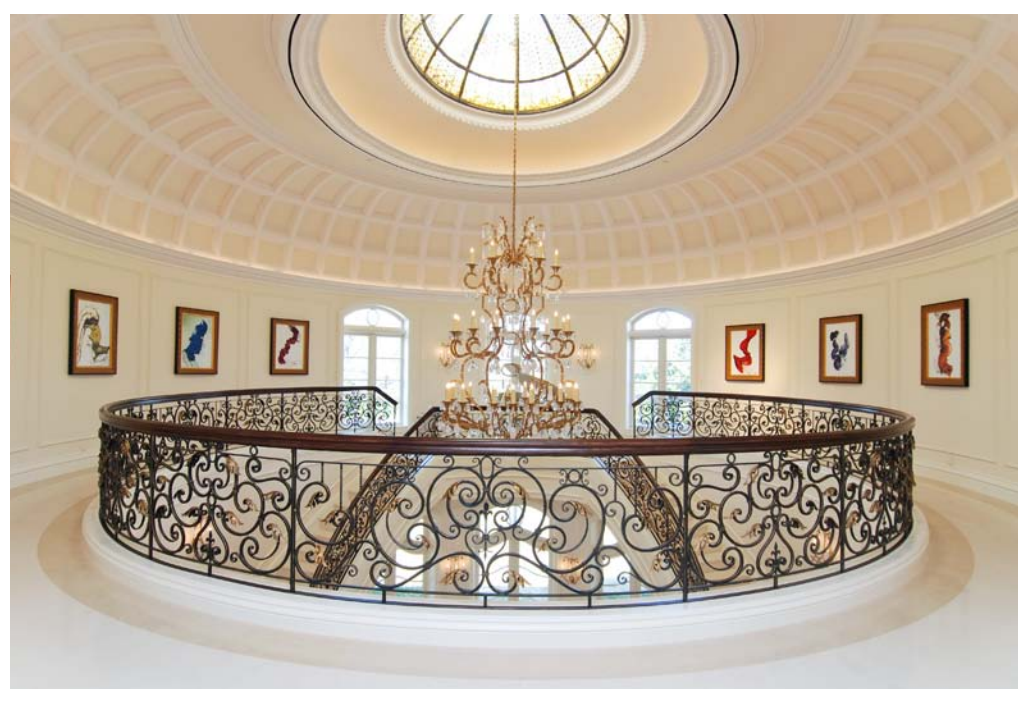
Second Floor Gallery, Tiffany Dome and Rotunda Reveal