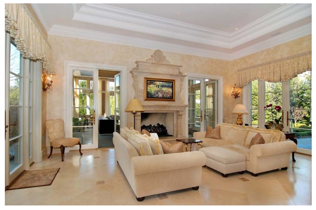
Great Room (exterior vistas not pictured)