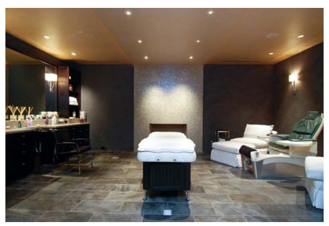
Spa Vestibule and Pamper Salon