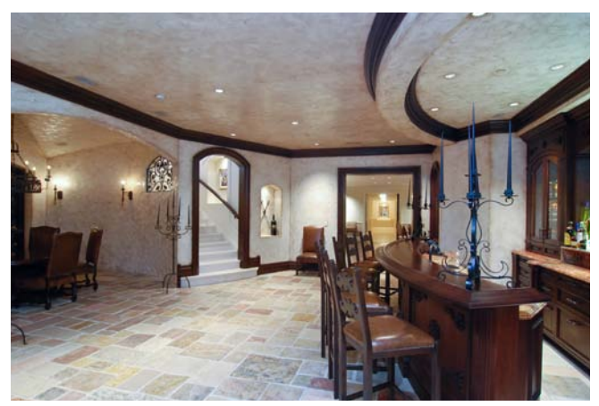
Wine Room and Cellar

Cabana. Staff Suite. Additional Guest Room.