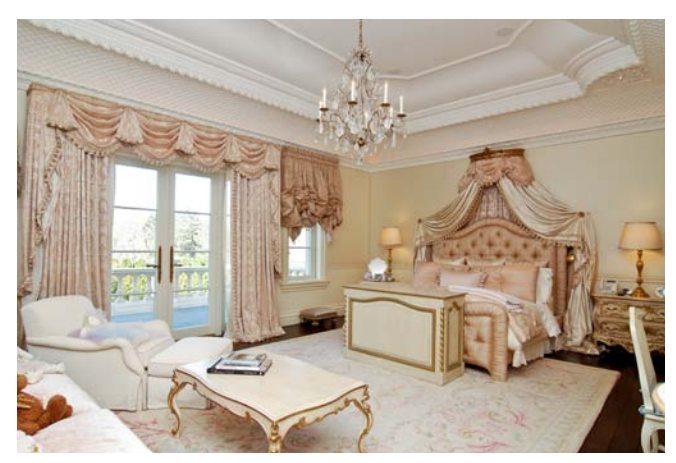
Young Woman's Bedroom Suite