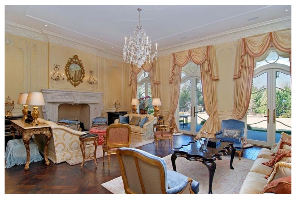
Richard Landry Design, his first Chicago Classic.

Millwork walnut accessories and heavily ornate plaster walls, crown molding and ceiling with secret passage to a butler's pantry and additional kitchen capacity for entertaining. Hand-scraped walnut floors, hand-carved limestone fireplaces with sconces and rock crystal chandeliers. Wired for Lutron Roll Down Shades - all appointments too numerous to mention (request a complete listing). Not pictured, a room bar with Onyx countertop and Sub-Zero wine refrigerator and refrigerated drawers. Grand formal spaces flow and you host with pleasure and serve. Joie de vivre.