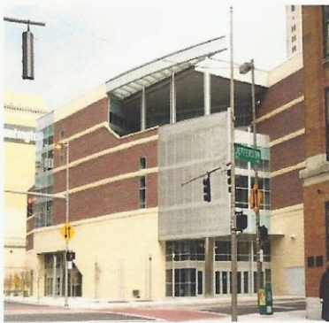
The Huntington Center, completed in 2009, is home to all sorts of sporting events, including the Toledo Walleye ice hockey team.

Toledo is home to thirty-two separate charter schools in addition to its traditional public schools—including Toledo School for the Arts and the Eagle Academy for advanced K-8th graders— as well as 13 private academies ensure that there is a place for every student to succeed.