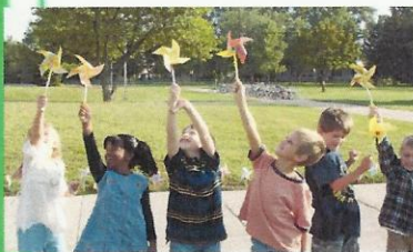
Children at a Perrysburg elementary school.