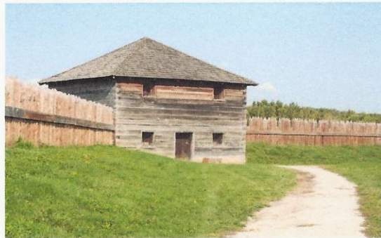
Fort Meigs, a recreation of the fort that was built here in 1813.