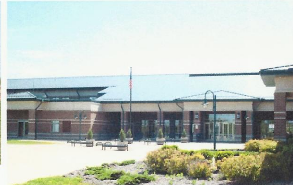
The recently built Perrysburg High School.