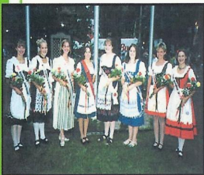
Participants in the 45th annual German-American Festival, an Oregon summer tradition.

Rated Excellent by the Ohio Dept. of Education for the third consecutive year, the Oregon City Schools have all been recently renovated or are newly built. In addition to providing an excellent traditional education, the Oregon City Schools has a wide array of vocational programs, a high graduation rate, as well as an array of extracurricular activities.