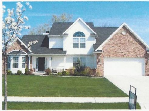
Waterville Elementary Area

Close to downtown Historic Waterville, homes in these neighborhoods have all been built in the past 10-15 years. In the low to upper $200s, these homes offer large lots with ample room for gardens and swingsets; many of them are wooded. These communities are also close to the Anthony Wayne High School, Waterville Elementary School, as well as the Fallen Timbers Shopping Center.