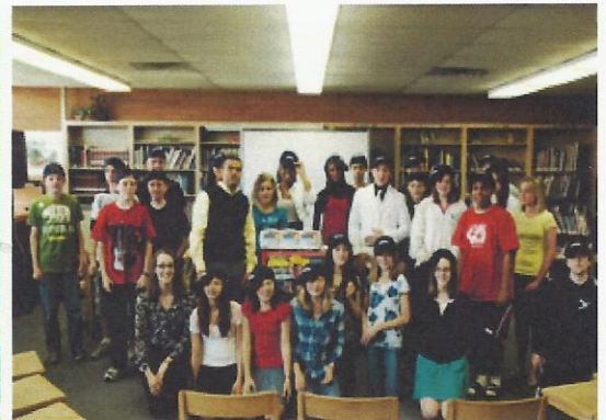
Children at Waterville Middle School