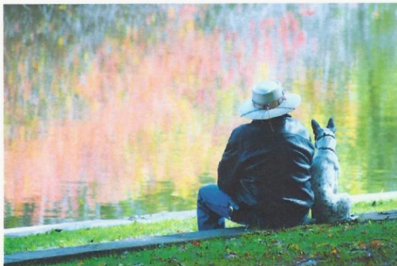
A man and his best friend take in the sights at Oak Openings Preserve