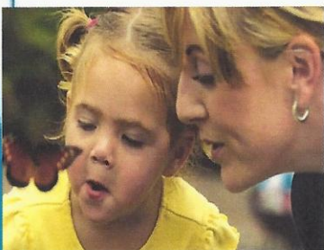
A mother and daughter at Waterville's Butterfly House.