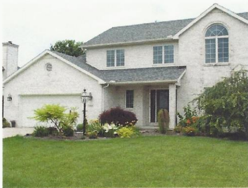
Bridgheampton Woods & Millcreek Farms

Picturesque views come standard with any home in this golf course community. These homes are 10-15 years old, and many are located on the fairway. Homes here cost from the low- to- upper $200s, and are in close proximity to the Fallen Timbers Shopping Center, as well as easy access to the expressway. Besides the beautiful views and beautiful homes, Fallen Timbers Fairways offers residents one of the area's best locations.