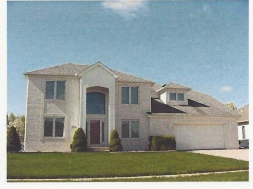
Fallen Timbers Fairways

Featuring newly constructed homes by North Creek Builders, as well as offering you the chance to design the house of your dreams, Crimson Hollow is the perfect place to put down roots. Seconds from the Fallen Timbers Shopping Center, the Fallen Timbers Golf Course, as well as Anthony Wayne High School and Waterville Elementary, Crimson Hollow is in the center of all of Monclova's activity. Homes range from the mid-$200s to the upper $300s, and include all of the features which come standard to North Creek Homes, including granite countertops, maple cabinetry, and custom paint colors.