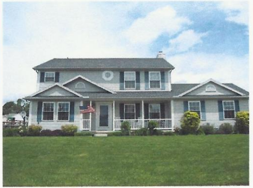
Olde Farm & Blystone Valley

As the title suggests, these homes are within walking distance of the Waterville Elementary School, and is also minutes from Waterville's Historic Downtown. These subdivisions were mostly constructed in the 1980s, and the pricing spectrum ranges from the upper $100s to mid- $200s, making this a great place for families to settle down. Traditional homes in a traditional neighborhood creates the appeal of this area.