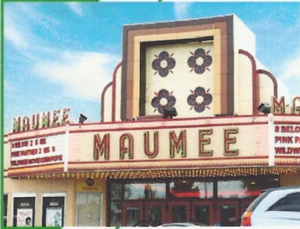
The Maumee Indoor movie theatre, a Maumee landmark, was built in 1946. It was renovated and reopened in 2004.