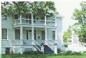
The Wolcott House, circa 1836, is one of many architectural remnants that remain in Maumee of times gone by.

Maumee was the first chartered school district in the state of Ohio, and their reputation for excellence has not diminished with time. Considered "Effective" by the Ohio Board of Education, Maumee excels in academics. Additionally, the Performing Arts Center at the High School, completed in 2005, provides space for spectacular theatre productions every spring.